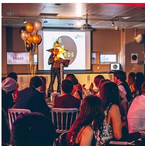
Star Awards 2019