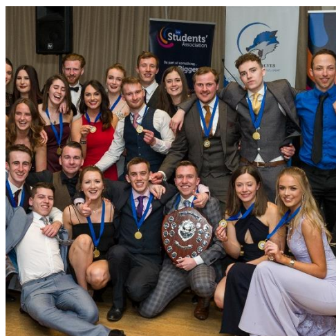
Sports Awards Ball 2019